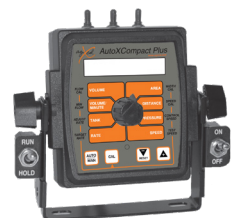
AutoX- Compact Plus

**Liquid module must be purchased from your John Deere, Trimble or Ag Leader Dealer.