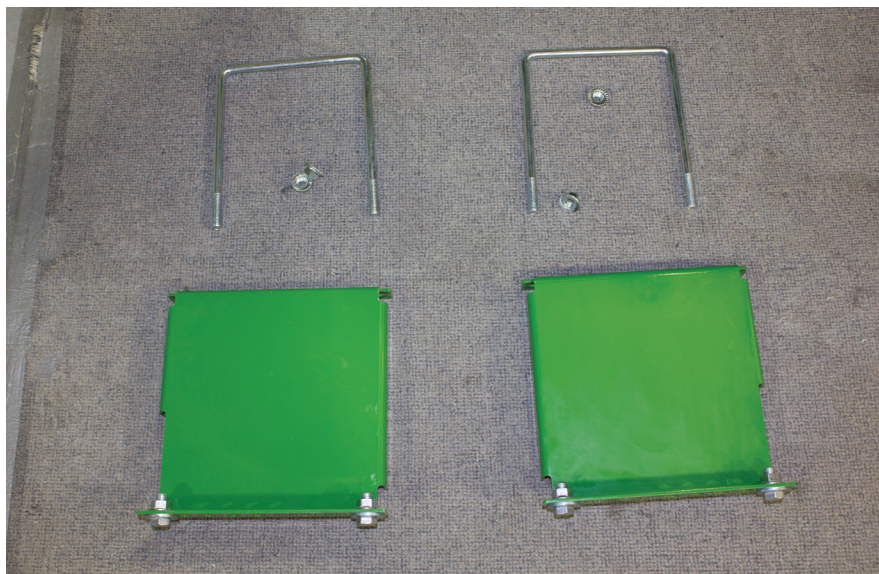
GX2 EXTENDERS (L) (R)